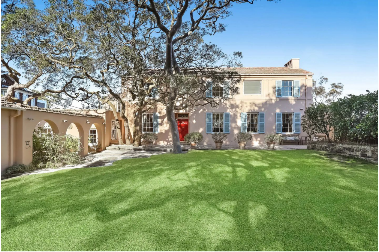
Figure 3: Sydney Morning Herald image of the 'Greenway' property published 2 July 2022