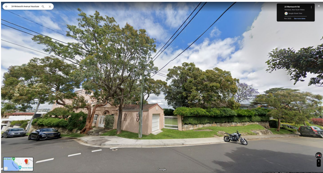
Figure 5: 'Greenway' photographed in Google Street View