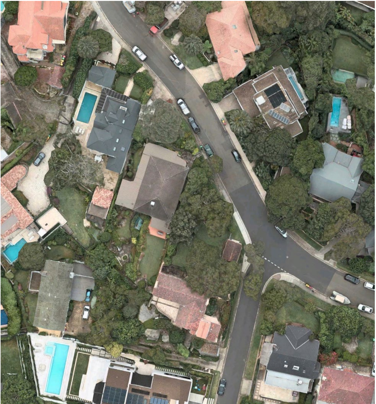
Figure 2 : Satellite image of the site – Google maps