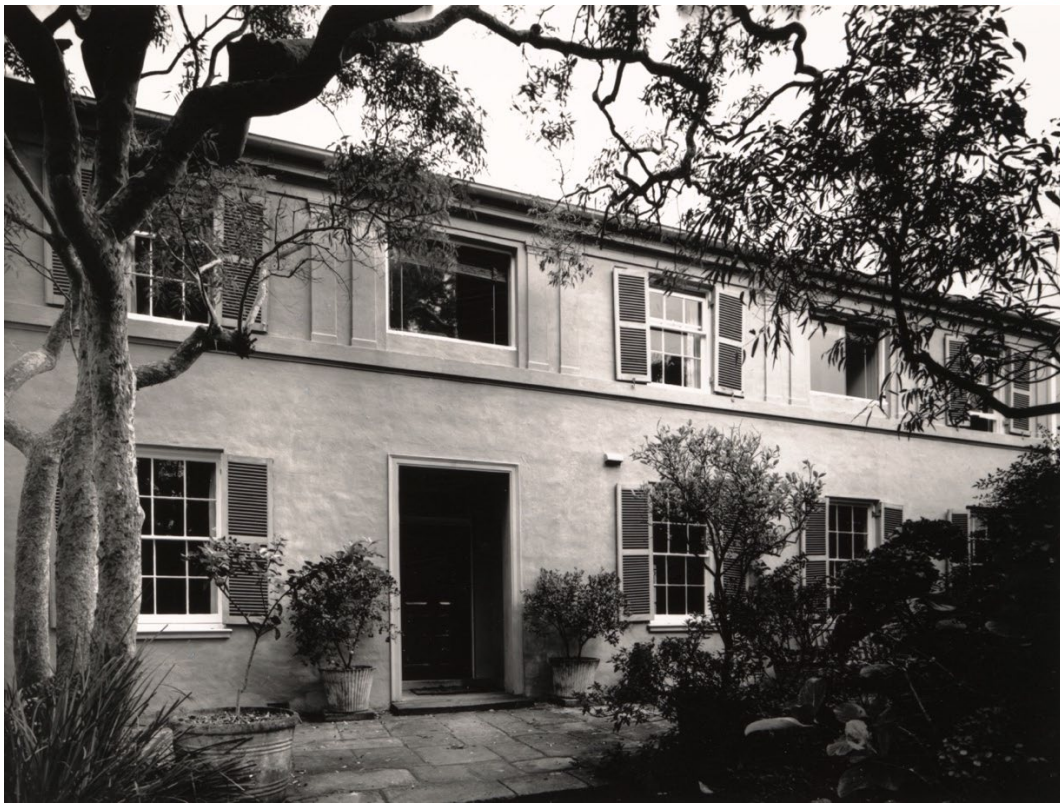
Figure 4: Photograph by Mitchel Solomon, 1988 published in Apperly, 1989. Inter-War Mediterranean c. 1915-c. 1940, page 172, image no. 430 courtesy of Caroline Simpson Library, State Library NSW.